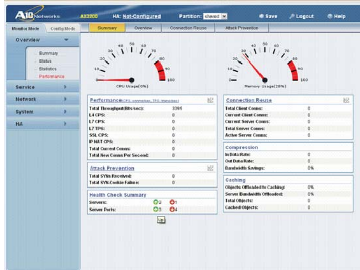
AX Series GUI Example